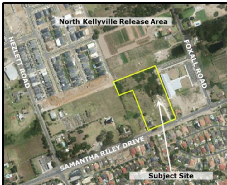
Figure 1 Aerial view of the site and surrounds

An aerial view of the site and surrounding locality is provided in Figure 1 below.